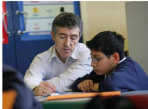
Canllawiau Cylchlythyr Llywodraeth Cymru Rhif: 02/09/11 Dyddiad rhyngoddi: Medi 2011

Revised professional standards for education practitioners in Wales