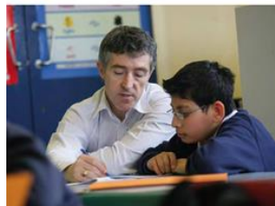
Guidance Welsh Government Circular No: 02/09/11 Date of issue: September 2011