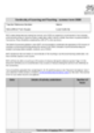
Continuity of Learning and Teaching Form