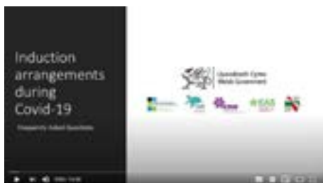
Video Link to YouTube

Please can you ensure that these reach your NQTs and schools. As previously, GwE will contact the EVs with the updated guidance. The guidance will also be available on the GwE, EWC, Hwb and Welsh Government websites.