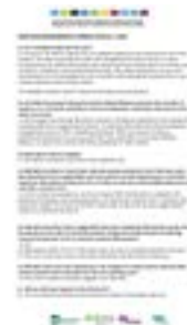
Covid-19 Induction FAQs

GwE induction lead contact details: Ieuan Jones: